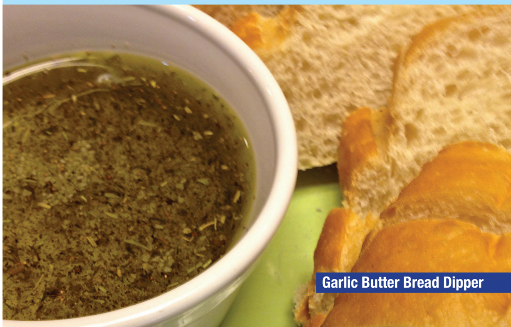
Garlic Butter Bread Dipper