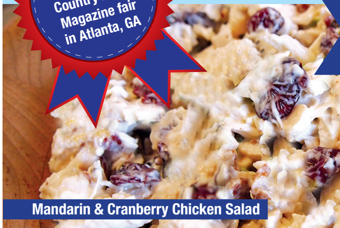
Mandarin & Cranberry Chicken Salad